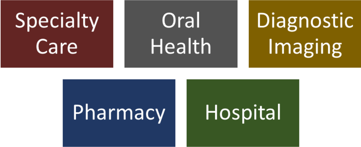
Figure 1: The five domains of primary care integration included in this report

were: 1) How integrated are community health centers with their surrounding medical neighborhood? and 2) What strategies have community health centers implemented to improve integration for their patients, in the interfaces between primary care-specialty care, primary care-oral health care, primary care-diagnostic imaging services, primary care-pharmacy services, and primary care-hospital care? (Figure 1). The primary care-behavioral health interface is covered in a separate report under this program.